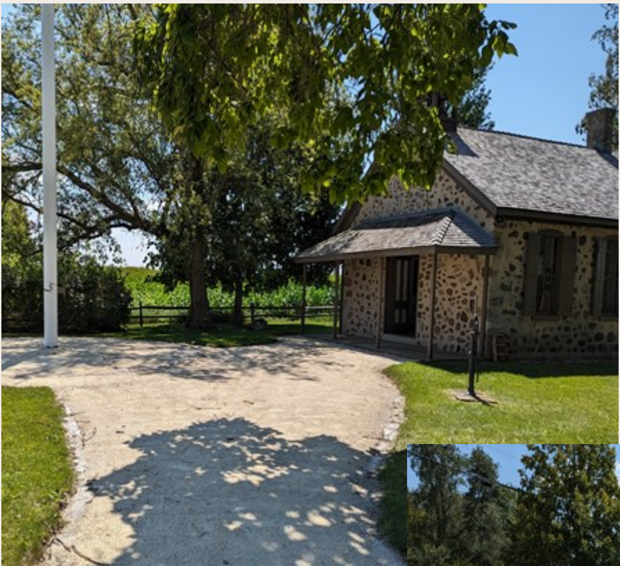
Other projected needs at the school house are plaster repair and painting, new windows, new perimeter fencing and flag pole solutions.

The paths at Stony Hill School were getting weedy and hard to maintain. Thanks to a wonderful donation made by Hartmann Sand & Gravel Co., Inc. of Fredonia, all the stone was replaced on the paths from the parking lot leading up to the school house. All In One Lawn Service worked to spread the stone material throughout the area. This was a well-needed improvement, just in time for the Ozaukee County Historical Society Fall School Tour Program.