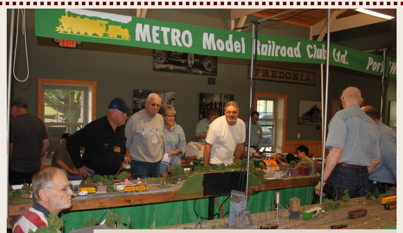
Train Show September 9, to benefit the Caboose Restoration Project—Metro Model Railroad Club.